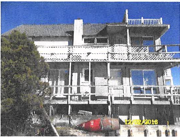
Right Side View -- Date of Photograph: (See Photo Stamp)