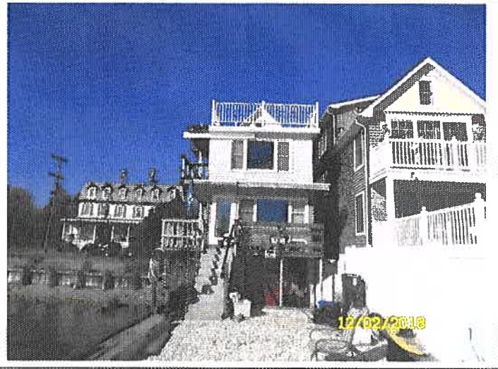
Rear View -- Date of Photograph: (See Photo Stamp)